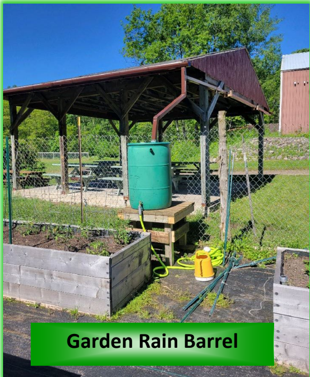
Garden Rain Barrel