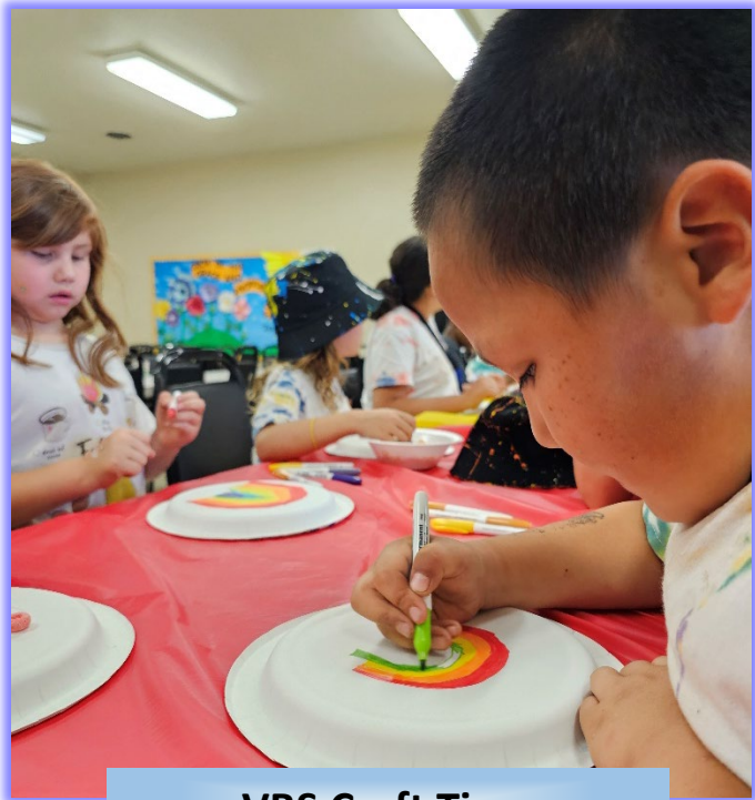
VBS Craft Time