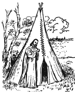
REACHING THE FIRST AMERICANS FOR CHRIST