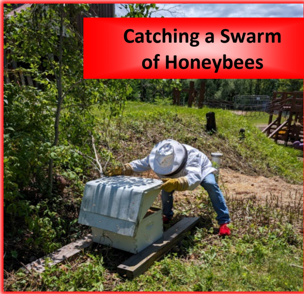
Catching a Swarm of Honeybees